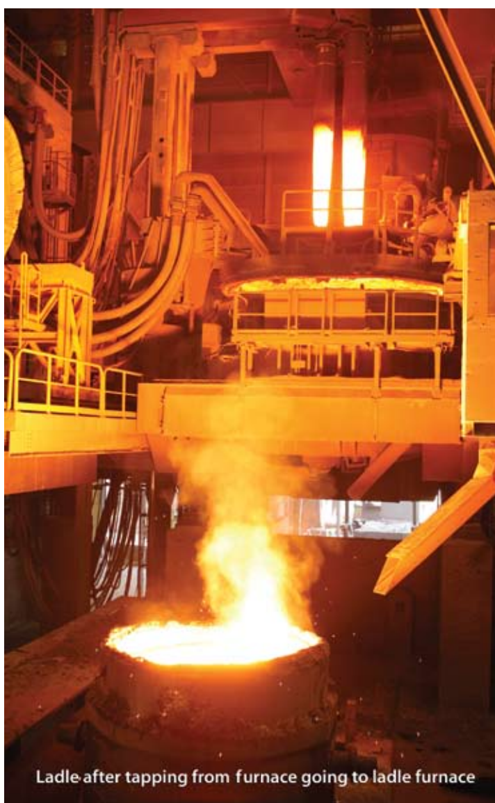
Ladle after tapping from furnace going to ladle furnace

RHI will supply the rapidly expanding enterprise with two more high-tech heat resistant gunning robots equipped with laser technology – an RHI innovation – for use in electric arc furnaces at temperatures of 1,500° Celsius, together with refractory products and services for other steel-making aggregates and applications. RHI's technological and product know-how has given Qatar Steel even more efficient, precise and safe ways of dealing with the refractory fittings in its aggregates. In addition, savings in maintenance time and repair materials and increases in productivity through improved plant availability are expected. The entire technology package will enable Qatar Steel to produce additional quantities of liquid steel every year.